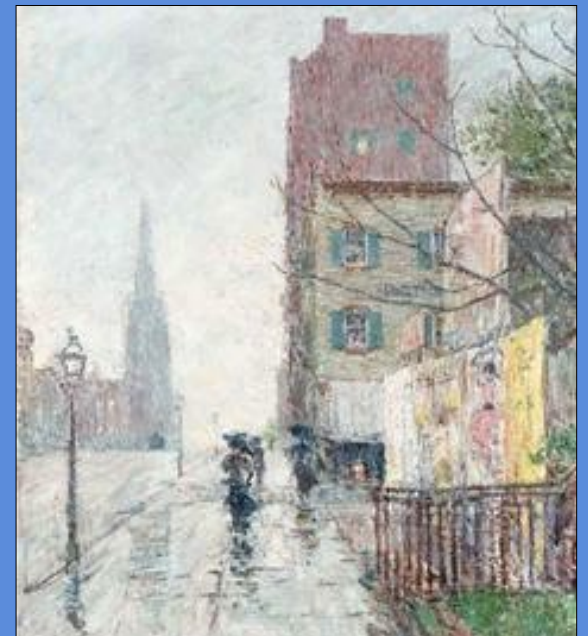
RAINY DAY , AMERICAN IMPRESSIONIST FREDERICK CHILDE HASSAM, 1859-1935